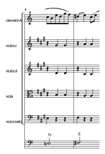
Figure 4. Elimination of ornamental notes and reconstruction of incomplete harmony. (Trio of the Clarinet Quintet by Mozart, KV 581)

The figure 5 shows the resolution of ambiguities: