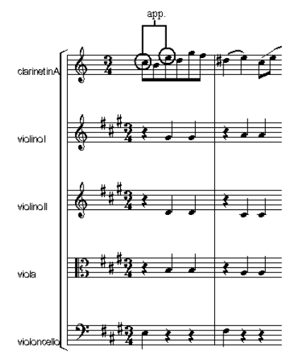
Figure 1. Ornamental notes and incomplete harmonies (Trio of the Clarinet Quintet by Mozart, KV 581)

This is illustrated in the following example: