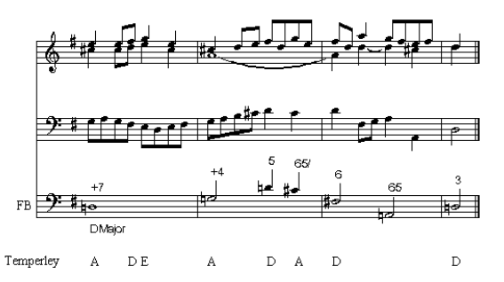
Figure 11. Gavotte from French Suite n°5 by J.-S. Bach

There are several drawbacks in this Figured Bass: