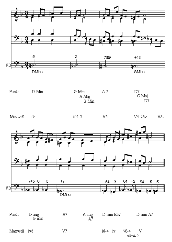
Figure 10. Sarabande in D minor by J.-S. Bach

For the purpose of comparing our models with other work, we show here the result of the production of figured bass applied to a fragment of a Sarabande in D minor by J.-S. Bach, whose analysis can be found in the papers of Maxwell [6] and Pardo [8]: