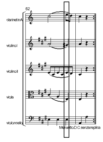
Figure 2. Ambiguous harmony. (Trio of the Clarinet Quintet by Mozart, KV 581)

Some ambiguities have to be resolved, since certain vertical aggregations are not "true harmony", as shown in the following example: