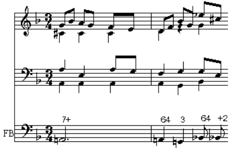
Figure 7. Measures 6 – 7 , Sarabande in D minor by J.-S. Bach

This last example shows that detection of figured bass is not constrained by rhythm: