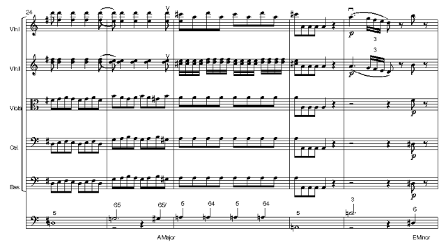
Figure 9. Mozart's "Eine Kleine Nachtmusik"

The musicologist easily recognizes in measure 28 the main entry of the second theme, in D Major.