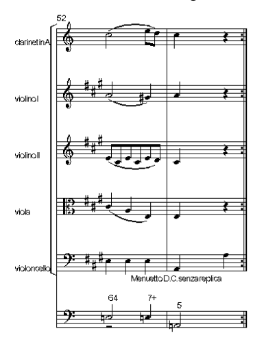
Figure 5. Resolution of ambiguities (Trio of the Clarinet Quintet by Mozart, KV 581)

The figure 5 shows the resolution of ambiguities: